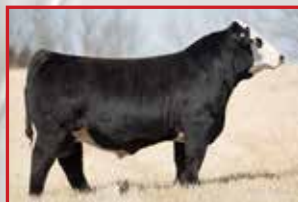
LLSF Jack Pot J1, Pasture Sire