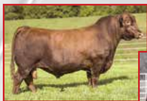
C-Bar Just Right 0225H, Sire