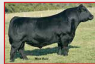
PVF Insight 0129, Sire