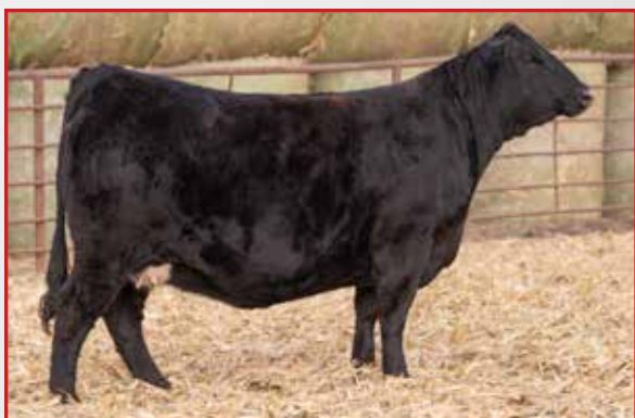
Rubys Yetti 261K, Dam