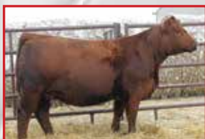
ES J12, Dam