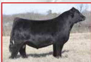
WHF/JS/CCS Double Up G365, Sire