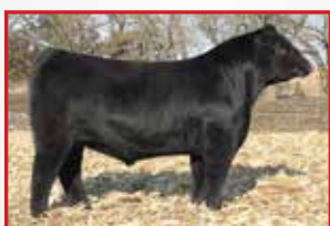
TL Bottomline, Sire