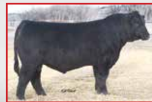
LBRS Genesis G69, Sire