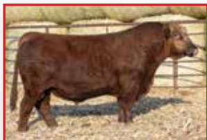
KBHR Sriracha H127, Sire