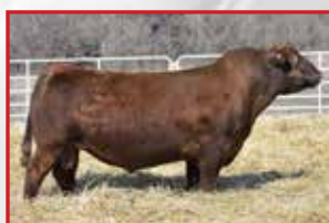
Bieber Maximus E294, Sire