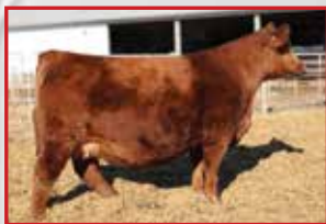
HILB/SHER G749E "Bliss" Grandam