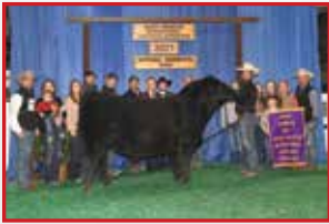
Rocking P Private Stock H010, AI Sire