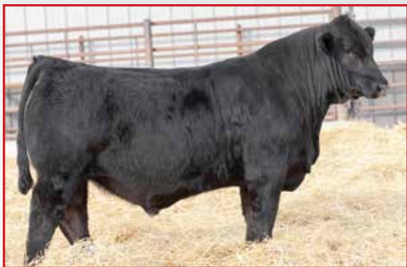
CLRS Guardian 317G, Sire