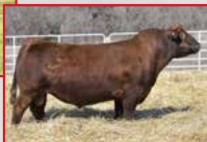
Bieber Maximus E294, Sire

Harmonys Windsong 0269, Grandam of Lot 5 & 6