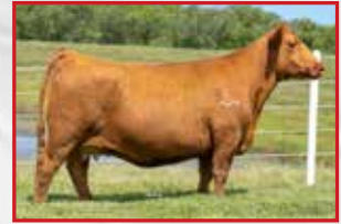
SC Windsong H512, Dam of Lot 48