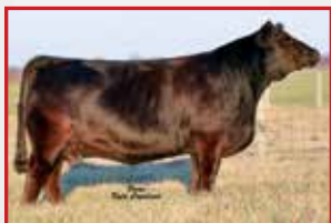
LLSF Cayenne UP401, Dam