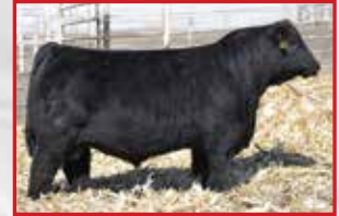
KBHR Bold Ruler H152, Calf Sire