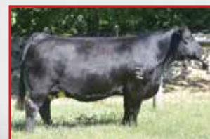
HPF/Borne Knockout Y030, Dam