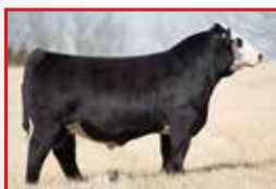
LLSF Jack Pot J1, Calf Sire of Lot 31