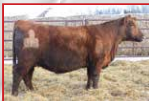
EIR J120, Dam