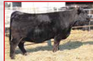
HILB Lost N Love E44G, Dam