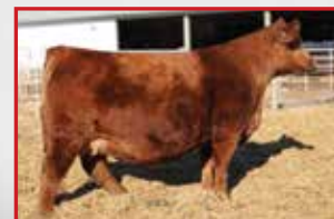
HILB/SHER G749E, Dam