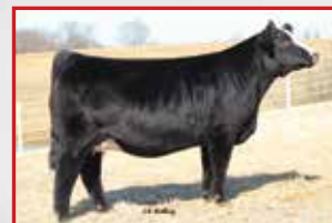
SC Robins Kiss D27, Dam