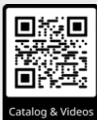
Catalog & Videos