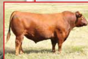
Lacy Collusion 115F, Sire