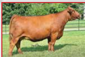
WHF/PRS/HPF Alley 247Y, Relation