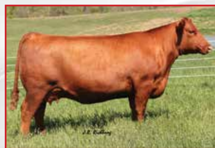
Harmonys Windsong 0269, Dam