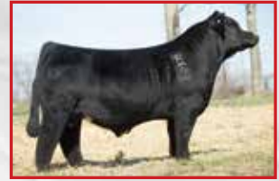
Ruby NFF Up The Ante 9171G, Sire