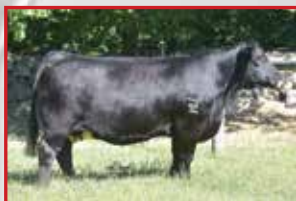
HPF/Borne Knockout Y030, Dam