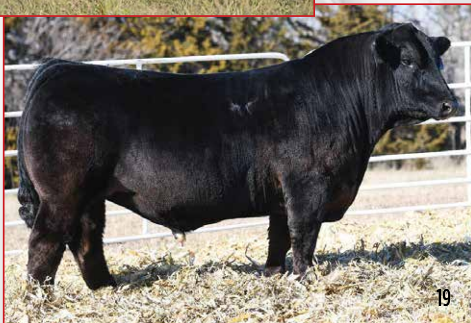
Mr SR 71 Right Now, Sire Lot 19