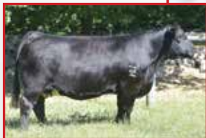
HPF/Borne Knockout Y030, Dam of Lot 11 and Grandam of Lot 12