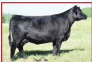
LLSF Urababydoll U194, Grandam