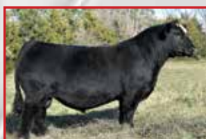
W/C Fort Knox 609F, Relation