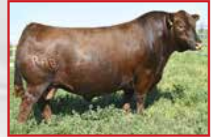
Bieber CL Energize F121, AI Sire