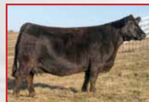
SC Daisy Duke C1, Maternal Sister