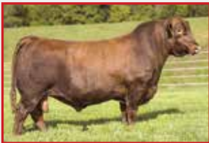
C-Bar Just Right 0225H, Sire