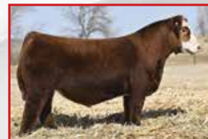
W/C Bet On Red 481H, Sire