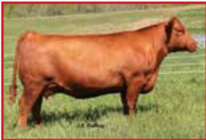
Harmonys Windsong 0269, Grandam