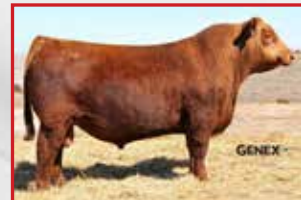
C-Bar Baron 207J, Sire