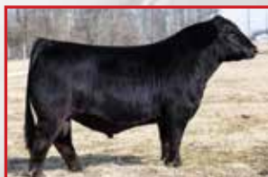
WHF Point Proven H45, Sire