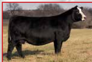
PVF Dream Lady E70, Dam