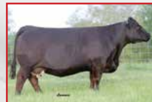
STF Onyx 451W, Dam