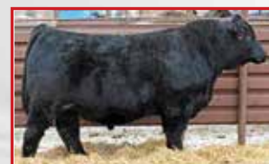
BCLR Cash Flow C820, Sire