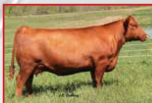
Harmonys Windsong 0269, Grandam