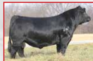
CLRWTR Clear Advantage H4G, Calf Sire of Lot 30