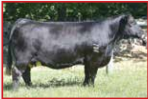
HPF/Borne Knockout Y030, Grandam