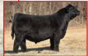
LLSF High Profile J903, Sire