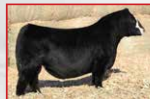
ZTGC Just Cuz 52K, AI Sire