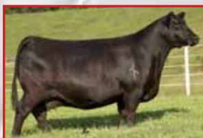
Partisover Burgess 825, Dam