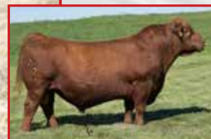
Bieber Hard Drive Y120, Grandsire