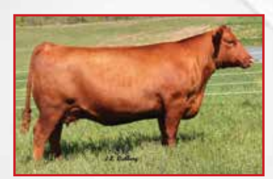
Harmonys Windsong 0269, Dam of Lot 51 & Grandam of Lot 53