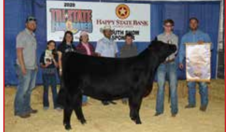
SC Robins Kiss G110, Full Sister