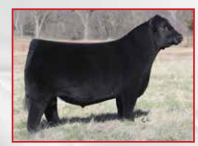
Gateway Follow Me F163, AI Sire