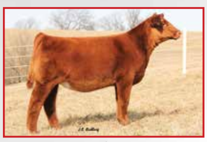
SC Shasha D109, $11,750 Full Sister