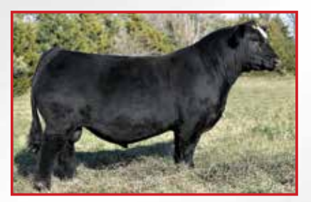
W/C Fort Knox 609F, AI Sire