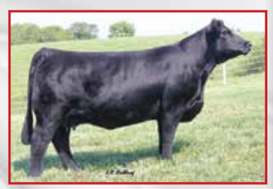
SC Daisy Duke C1, Dam