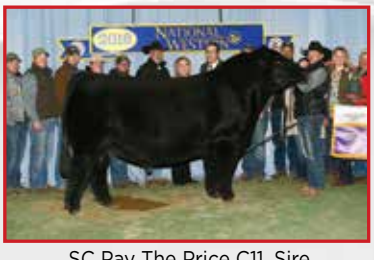
SC Pay The Price C11, Sire of Lot 5