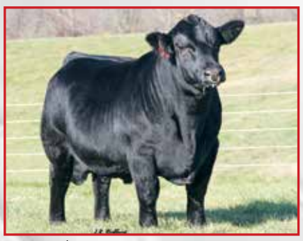
LLSF/VLF Reactor A40, Sire of Lot 21