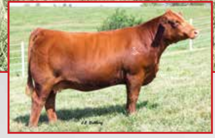
SC Shasha Z162, Dam

If it's not the red color that sets this one apart on sale day, it will definitely be her mass power, size and look. SC Shasha C152 is a full sister to a trio of red heifers that turned heads and had the bids flying at the Gathering in 2017. It's difficult enough to make black purebreds this good, let alone a red one this impressive. The new owners here won't have to wait long to put her to work, she's due to calve to W/C Fort Knox shortly after sale day and from what we are seeing there should be one of the most anticipated red purebred Al sires to hit the scene coming up this year!