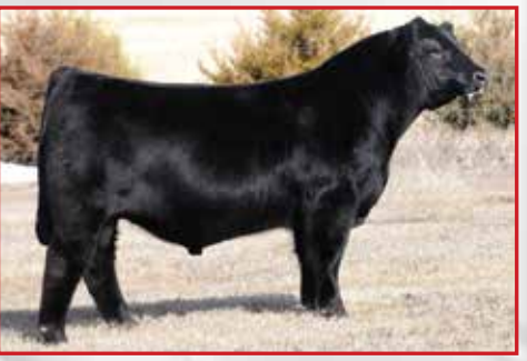
W/C Relentless 32C, Sire of Lot 25A