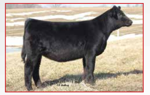
SC Robins Kiss G106, Full Sister