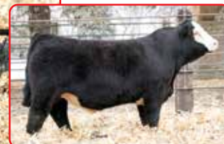
Rockin H Mr. Heisman H08, Maternal Brother