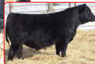
W/C Rest Easy 752G, Sire