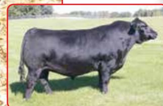
TJ Gold 274G, Sire Lots 5-13