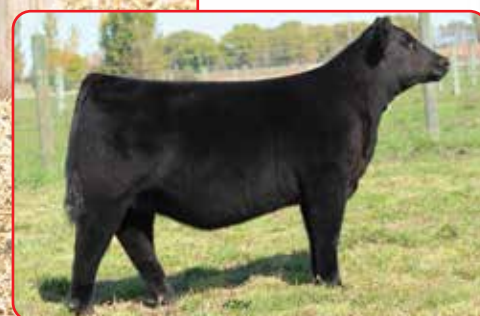
HILB Miss Emma E416, Dam

6K is an ET heifer that goes back to our Emma donor. We had a lot of fun showing her last summer. Her new owner is going to love how quiet she is. Her disposition is fit for a young showman. We feel she has what it takes to compete at any level.