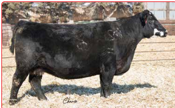
60 Rockin H Ms. A205