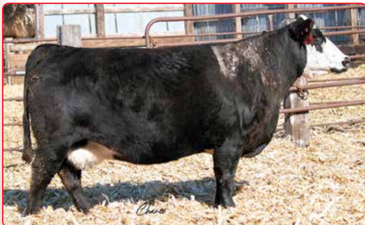
57 Rockin H Ms. 260

Commercial cows used for receipts years prior bred back to Box Score, all the cows are enrolled in THE program so the calves registration is free for their 2023 calf. All the cows have been pasture exposed to Gonsior/GS Box Score #96, 3841331.