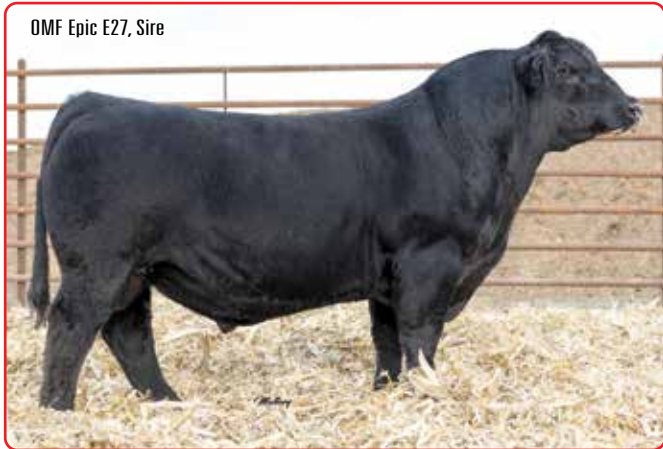
OMF Epic E27, Sire

Massive, deep-ribbed Epic son that excelled fast weaning and still hasn't slowed down. Purebred Homo-black/homo-polled. Number 2 gaining bull.