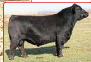
WBF Success F153, Sire