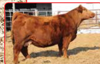
HILB/MBCC Princess Merinda, Dam