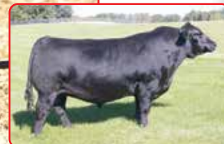
TJ Gold 274G, Sire Lots 5-13