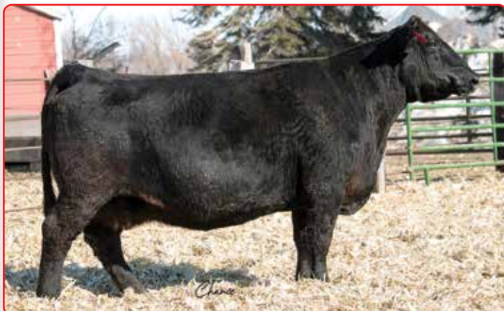
59 Rockin H Ms. 239R