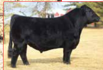
CDI Innovator 325D, Sire