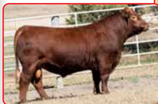
Bar CK Red Empire 9153G, Sire