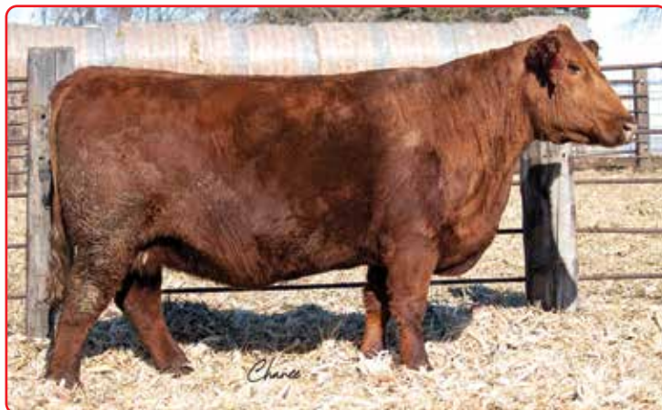
58 Rockin H Ms. A133