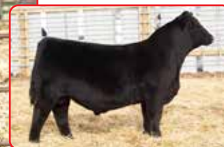
KLER Promoter G15, Sire