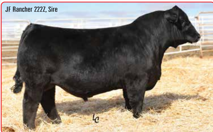
JF Rancher 222Z, Sire

Super thick, deep ribbed Cowboy Cut sired cow, that has produced her share of bulls for us over the years.