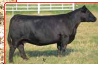
GW Miss GPRD 028X, Grandam