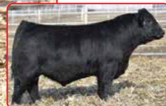
TJ Flat Iron 259G, Sire