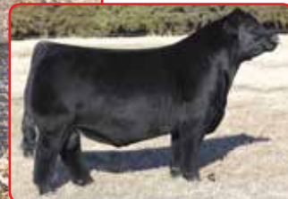
JSUL Something About Mary, Sire