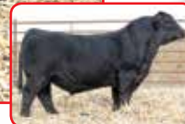
OMF Epic, Sire

Purebred Epic son out of a first calf heifer. The Epic sired calves are born easy and have a lot of vigor at birth. He has an actual birth weight of 75 lbs. and a CE of 12.2 and a YW of 135.