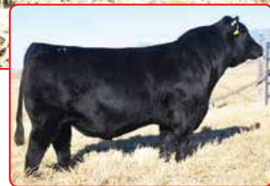
THSR Lover Boy B33, Sire

HTP/SVF Duracell T52 THSF Lover Boy B33 RP/MP Right To Love 015U CCR Cowboy Cut 5048Z Rockin H Ms. Carolina Rockin H Miss Y391