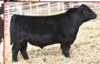
TJ Main Event 503B, Sire