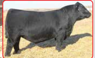
SAV Rainfall, Sire