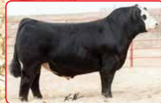
DMCC/Wood Fully Loaded, Sire