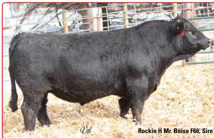
Rockin H Mr. Boise F66, Sire

A real cool, stylish, good haired, smooth fronted bull out of our Rockin H Mr. Boise F66, moderate and thick.