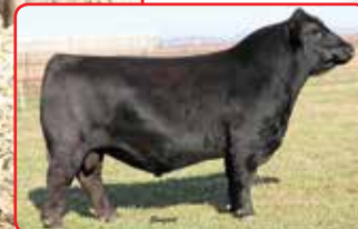
WBF Success F153, Sire