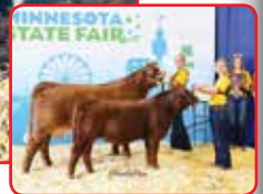
Loaded Beauty, Dam