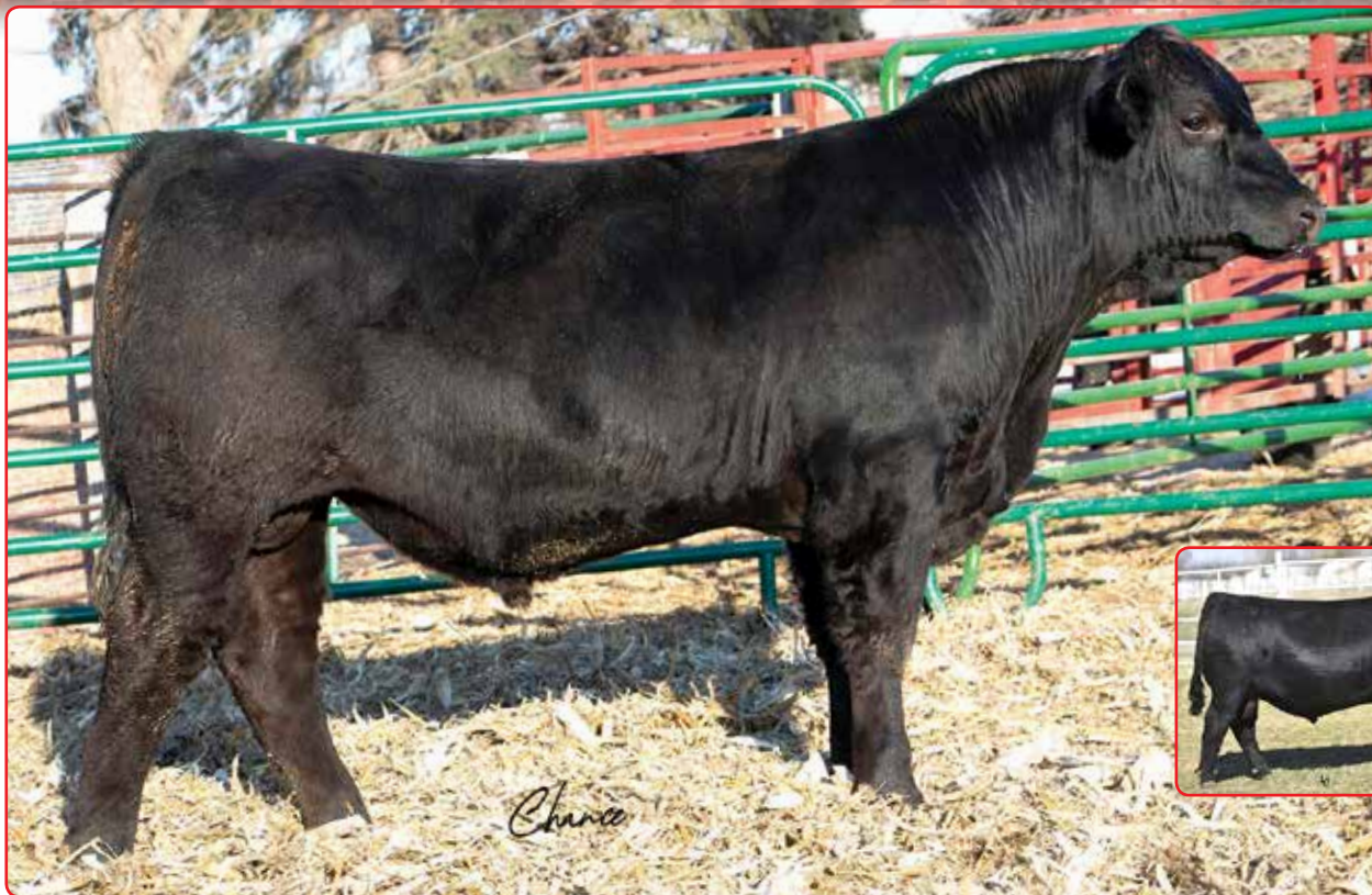
TNT BCR Unified B203, Sire