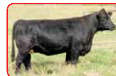
LHT Ms Olie 233Y, Dam