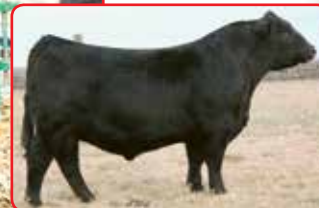
W/C Executive Order 8543B Sire