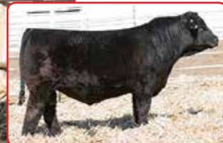
TJ High Plains, Sire