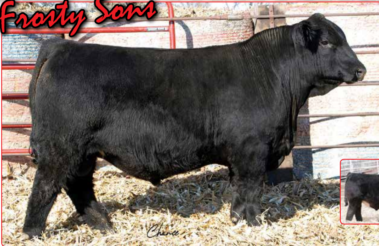
TJ Frosty 318E, Sire