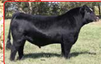
Mr. CCF 20-20, Sire