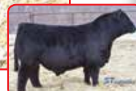
CDI Trustee, Sire

Here is a CDI Trustee son that is big topped and square hipped.