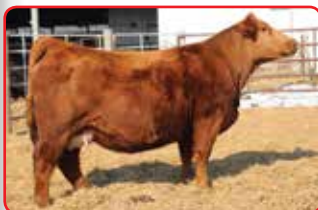
HILB/MBCC Princess Merinda, Dam

RED HEIFERS ARE HOTTT in the showing! We purchased this girl as a pair from Hilbrands last spring with the intentions of turning the cow into a donor cow. If she produces a calf like this every year, let's just say you'll be glad you have a daughter out of her! Scarlet is a such a sweetheart and has the potential to be a top-notch show heifer. She is broke to tie, no fault to her, I just ran out of time to get her broke to lead. Consigned by Nemitz Cattle Co.