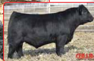
TJ Flat Iron 259G, Sire