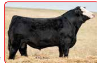
SSC Shell Shocked 44B, Sire