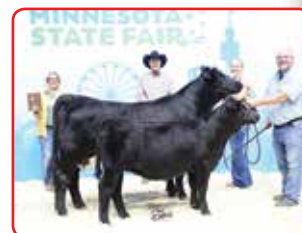
HILB/RJ Ms Behaven G132B, Dam