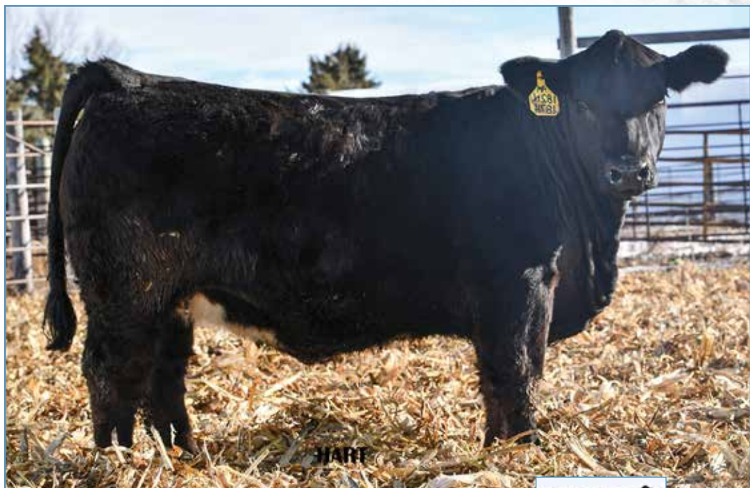
Hart Armour 173L, Sire

This Hart Armour 173L individual is right up there in terms of maternal greatness and is ready to take on her role as the next star in this industry. She brings a maternal design along with the balance of Beacon who was admired for his structural integrity and longevity. Galactica has that picture perfect udder quality that we will not compromise on, it is the lifeline needed to help grow that baby into something really special!