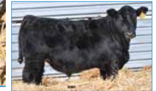
Hart Maverick 056K, Maternal Brother