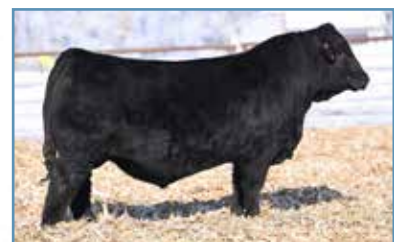
HLTS/CLRWTR Always On Time K4, Sire