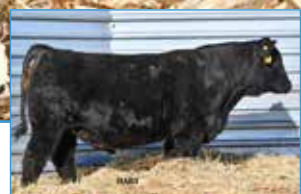
Hart Dakota 019G, Maternal Brother