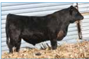
Hart 247L, Maternal Brother