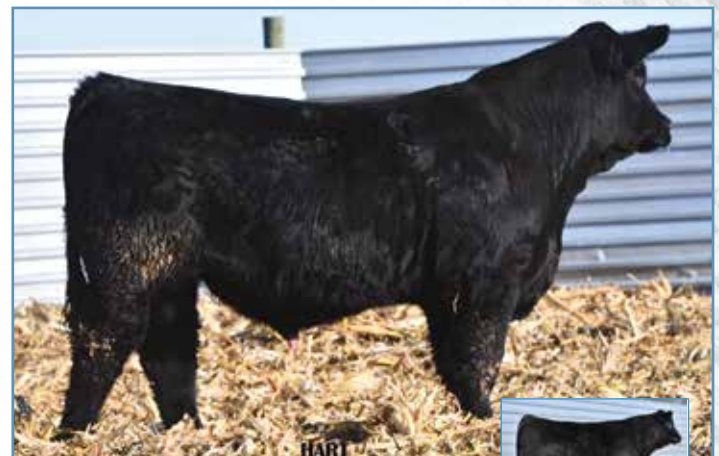
Hart Life Time 100M, Maternal Brother