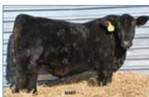
Hart 123M, Maternal Brother