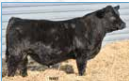
Hart 184M, Maternal Brother