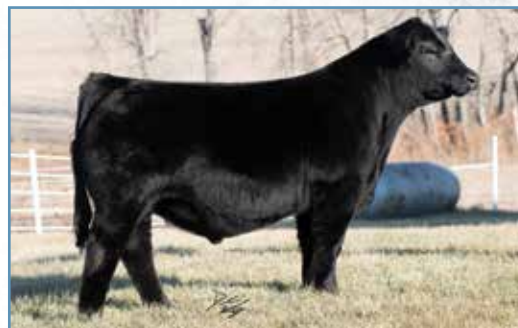
LHT Main Force 184G, Grandsire

We love seeing these kind of results in a rookie herd sire! Hart Armour 173L is a Main Force son we kept to take over in Main Force's shoes and boy did he sure fill that role perfectly! 187N has his own big shoes to fill and we think he put on a strapin' pair of steel toe work man boots. Hard to dispute his performance on paper and in person.