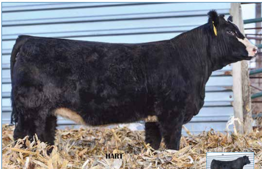
Hart Jaw Breaker 058K, Sire of Lots 70-72

This is about as stacked as a toteboard can get. Hart Miss 121C is a rare jewel of a standout cornerstone of our breeding program. You don't have and sell as many sons and daughters from a natural bred female; those are donor cow stats. This impeccable baldy heifer out of Hart Jaw Breaker 058K will probably have us debating whether our decision to sell her was a mistake. Her flawless profile and flashy chrome pattern are second to none. One can appreciate her long sleek lines and smooth muscle pattern. Solid foundation on huge boned legs and extra-large hoof development. She is elegant through her front third, very clean fronted, bold in her rib shape and very sound on the move. As bright as a supernova is, this heifer has as bright a future for her next owners.