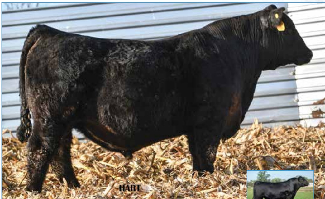
WHF Point Proven H45, Grandsire

We can't help contain our excitement over our newest herd sire from Wayward Hill Farms. To The Point is a Point Proven son that really intrigued us greatly when we saw him in the catalog and in video. There was never a shred of doubt that he wouldn't pair perfect with our cow power and boy, were we right! 032N is built as well as one can get and portrays just the right amount of frame to house all of that 925lbs. he is toting around. So let this stout boy help elevate your program and pack on those added pounds and your bottom dollar.