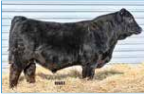
Hart Smoke Ring 150K, Maternal Brother