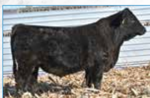
Hart Traffic Jam 154L, Maternal Brother

Here comes the next installment of power packed bulls produced by this Last Frontier daughter. No matter what herd sire we threw her way the results are always the same. This is her 4th bull in 4 years, each of the peas in a pod- sheer perfection! 232N's athletic physic is easily apparent when being evaluated. He has an abundance of frame, length, dimension and depth. We love this combination and can't wait to see what impact he will make for his next owner.