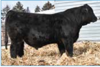
Hart 108L, Maternal Brother