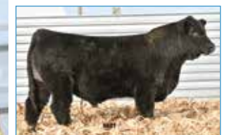
Hart Main Street 201L, Maternal Brother