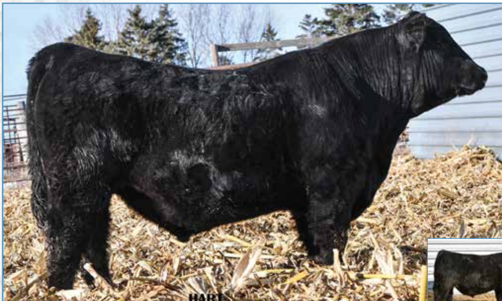
Hart Monopoly 028M, Maternal Brother