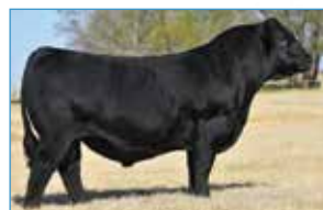
ES Right Time FA110-4, Grand sire