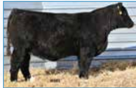
Hart Dolly 220M, Maternal Sister

Take a step back and think about your female factory. Let's face it, if the foundation females of your operation gives you a solid product either bull or heifer but you're needing an extra push to get you the most bang in your bottom line, that is where this cow power of Welsh's Warsaw and Turnpike combo becomes a key consideration for you. Hart 123G's speciality is already proven as a prominent female producing factory. This is her first bull calf and we feel he will take the initiative of his mother and give you gorgeous heifers that you can take your female foundation up to the next level.