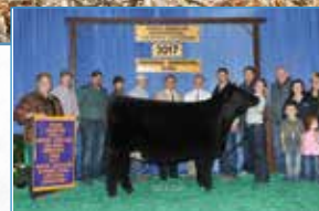
WHF Summer 365C, Grandam