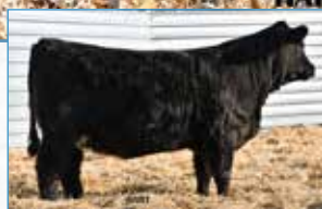
Hart Cher 049M, Maternal Sister

Every so often you will find an individual that just sticks out in your mind and no matter how hard you try, you just keep coming back to make sure you weren't delusional. Proven results speak volumes and just will not be denied. 234N claim to fame starts with his mother, Hart 106F (an WCS El Dorado 5209C) daughter that produced Hart 074J, who is Hart Lethal 025L's mom. Lethal sold in our 2024 sale to Westway Farms LTD. in Canada, and is doing great things up there. So do yourself a favor and put this herd bull prospect to work for you creating your own herd of Lethals.