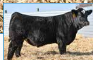
Hart Lockjaw 096M, Full Brother