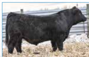
Hart 180J, Maternal Brother

TJ Gold 274G ES G157 WHF Eclipse E35 Hart Miss 146E