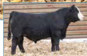
Traxs Distinction L12, Sire