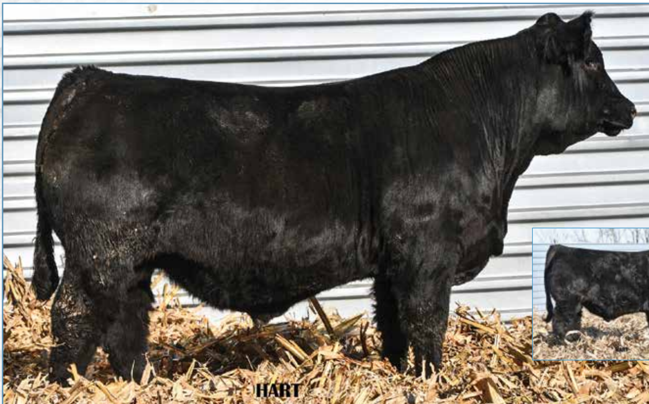
Hart 208L, Maternal Brother