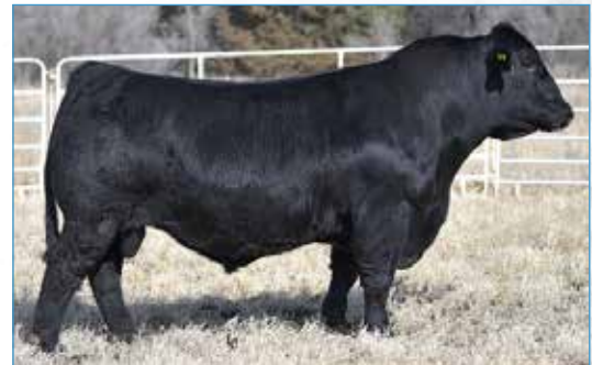
KBHR Honor H060, Grandsire