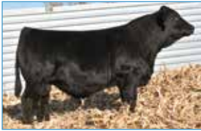
Hart Full Force 072L, Maternal Brother