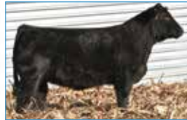
Hart Starlet 174L, Maternal Sister