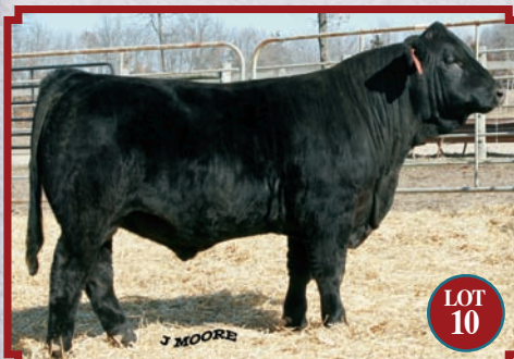
GCF Glance At Me Z12

WLTR Renegade 40U ET x GCF Dream Queen R1