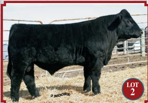
GCF Mr. Legend Z7

DJ Salution S502 x BF Miss Legend Drive S22 33 Herd Sire Prospects like this selling on March 16!