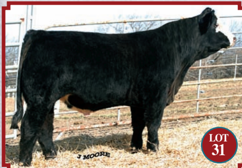
GCF Mr. Amigo Y146

GCF Mr. Amigo x GCF Antoinettes Lady T35