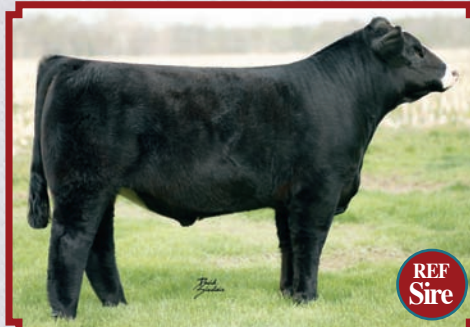
DJ Salution S502

WE LOOK FORWARD TO SEEING YOU SAT. MARCH 16 12:00 PM