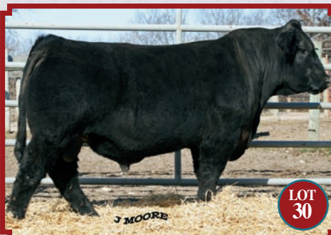
GCF Mr. Amigo Y143

WLTR Renegade 40U ET x GCF Ms First Glance S61