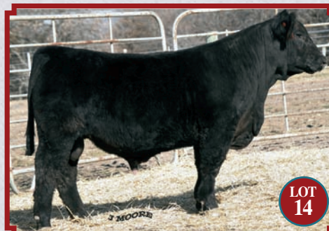
GCF Wide Body Z27

Rubys Wide Open 909W x Zeis BLL Miss Maximus