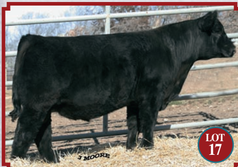
GCF Mr. Z36

Rubys Wide Open 909W x Zeis BLL Miss Maximus