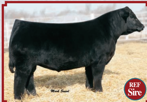
Mr. NLC Upgrade U8676