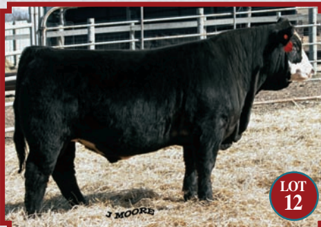
GCF Mr. Renegade Z16

GCF Mr. Amigo x GCF Antoinettes Lady T35