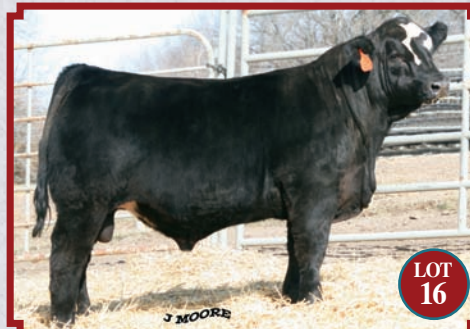
GCF Mr. Dream Machine Z42

WLTR Renegade 40U ET x GCF Miss Hummingbird R16