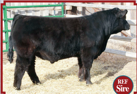
Yardley High Regard