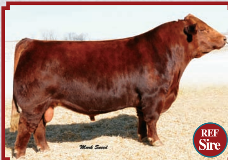
GCF Mr. Amigo

Selling 34 Performance Tested Simmental & SimAngus Bulls!