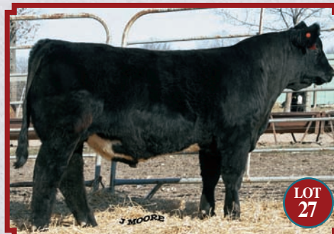
GCF Renegade Z70

WLTR Renegade 40U ET x JF Ebony's Joy 4131P