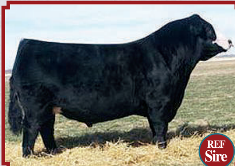
WLTR Renegade 40U