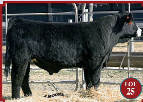
GCF Renegade Z65

Yardley High Regard W242 x Miss Werning KP 8543U