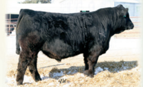
Triple C Heavy Hitter T195 Owned by Silver Spur Simmental, AR Full sib to Lots 3, 3A & 3B