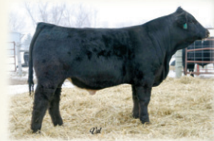
Triple C Royal Command P822 Owned by JP Black Simmentals, AR