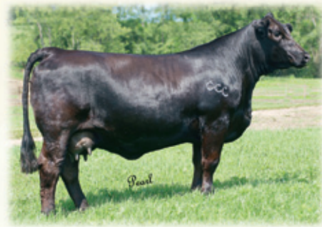
Triple C Lizzie S83L Owned by SVJ Farms, Valerie Mankey, PA Maternal sister to Lots 22 & 22A