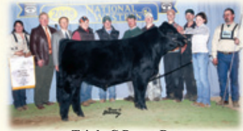
Triple C Power Dozer Res. Grand Champion Bull '08 NWSS Full brother to Lots 6 & 9