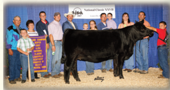
FC No Wonder - Champion Heifer 2007 AJSA National Classic XXVIII Owned by the Tarr Family, IL. Bred by Triple C Farms Maternal sister to Lots 22 & 22A