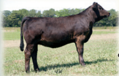
Triple C Tinkerbelle S30H Owned by Gramm Farms MN