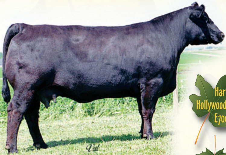
Hart Hollywood Queen E700