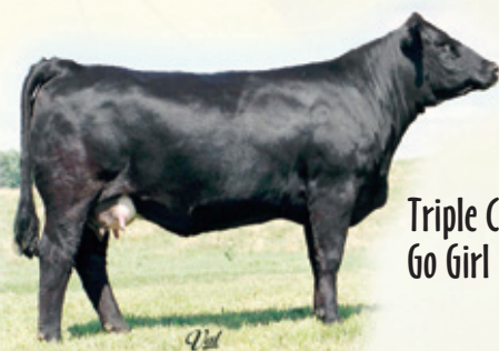
Triple C Go Girl K34G

Girl Talk ultrasounded one of the biggest ribeyes of the entire group. She is typical of the Go Girl x Power Drive matings – big middled, soft in her design, wide in her skeleton and, best of all, really free moving. She is easy keeping and moderate sized, but best of all, she possesses that added value the Go Girls have. There are far too many to name, but one of the most recent Power Drive x Go Girl progeny, Power Dozer, was named Reserve Grand Champion Bull at the 2008 NWSS in Denver for Parke and Nina Vehslage (IN). Buy Girl Talk with confidence – she will work for you.