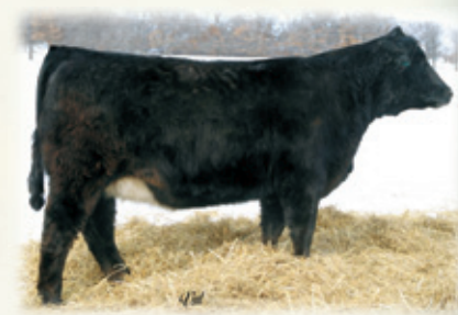
Triple C Ambition S26L Owned by the Walthers Family, TX Maternal sister to Lots 22 & 22A