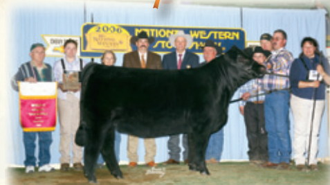
Triple C Miss Liberty P1 2006 Reserve National Champion Female