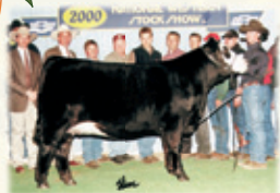
Drake Spice Girl