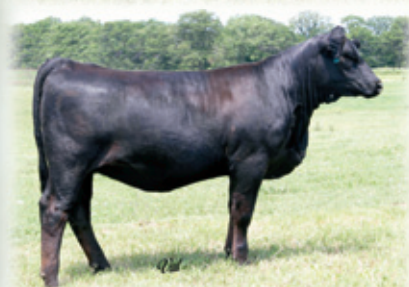
Triple C Lola S31K Owned by Hudson Pines Farms, NY Maternal sister to Lots 22 & 22A