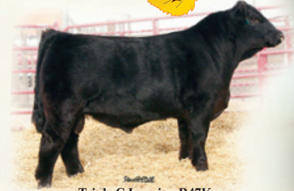
Triple C Invasion R47K

Full Brother to Lots 20, 21, 21A, 21B & 21C