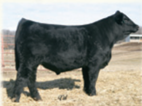
Triple C Bettis

The homozygous polled Designer Fashion is a full sister to Bettis, Singletary, Taylor and Sheer Design, a donor at Sanders Ranch (KS) and Sunset View Farms (KY). This Shear Force x Josie flush has generated as much revenue as any at Triple C. We all need to study our lessons here. Evaluate her genetic values as they are impressive. Evaluate her body make up, and you will find it equally impressive. It is hard to imagine that you could combine this much muscle and dimension in a sound structural, moderate framed, attractive package. Her cow family and genetics are as predictable as we can produce. This is why we spend sleepless nights and hours behind a computer in the cattle business so that we might produce cattle like Designer Fashion. We can only imagine how impressive her calf by Invasion will be. Top 1% of the breed for CE, Marbling, API and TI