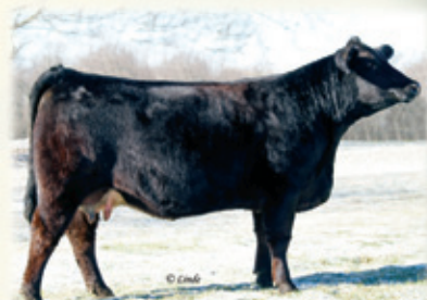
Triple C Radiant Angel