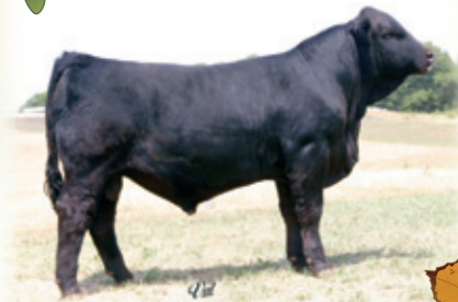
Triple C Badger R864H Owned by ETR Simmentals, NE & TCF