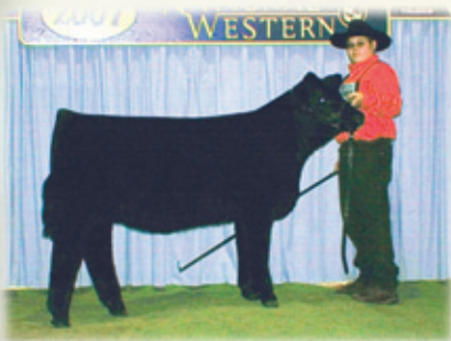
Independence as a calf in Denver