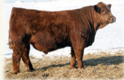
Triple C Major League T235 Owned by D Bar C, Canada Full sib to Lots 3, 3A & 3B