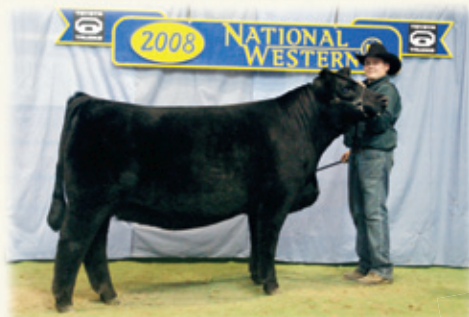
Independence as a yearling in Denver