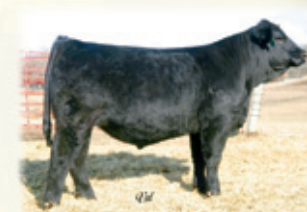
Triple C Singletary