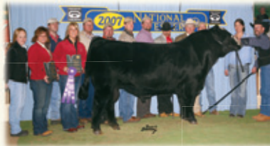
JS Burning Up 33R