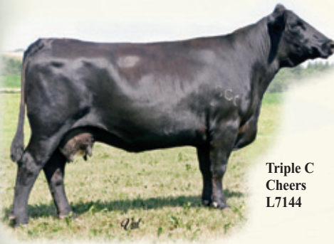
Triple C Cheers L7144