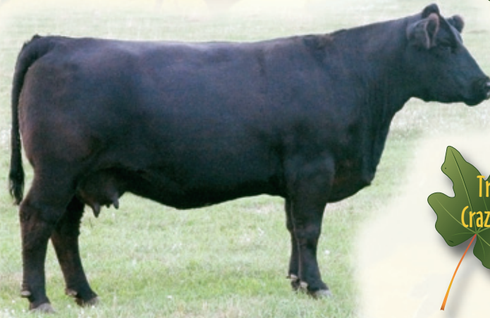
Triple C Crazy Queen L98

Co-Owned by Triple C Farms and Rolling Hills Farms, AR