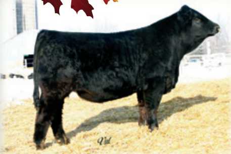
Triple C Perfect Power R274 Owned by Sachs Simmental, MO