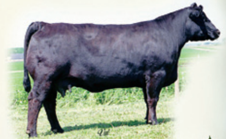
Hart Hollywood Queen E700