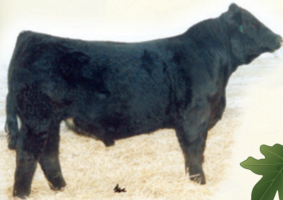
Triple C Majic Man M211

Black Dbl. Polled PB Female ASA#2439891 Tattoo: U014 BD: 2-6-08 Adj. BW: 68 ET Adj. WW: 683